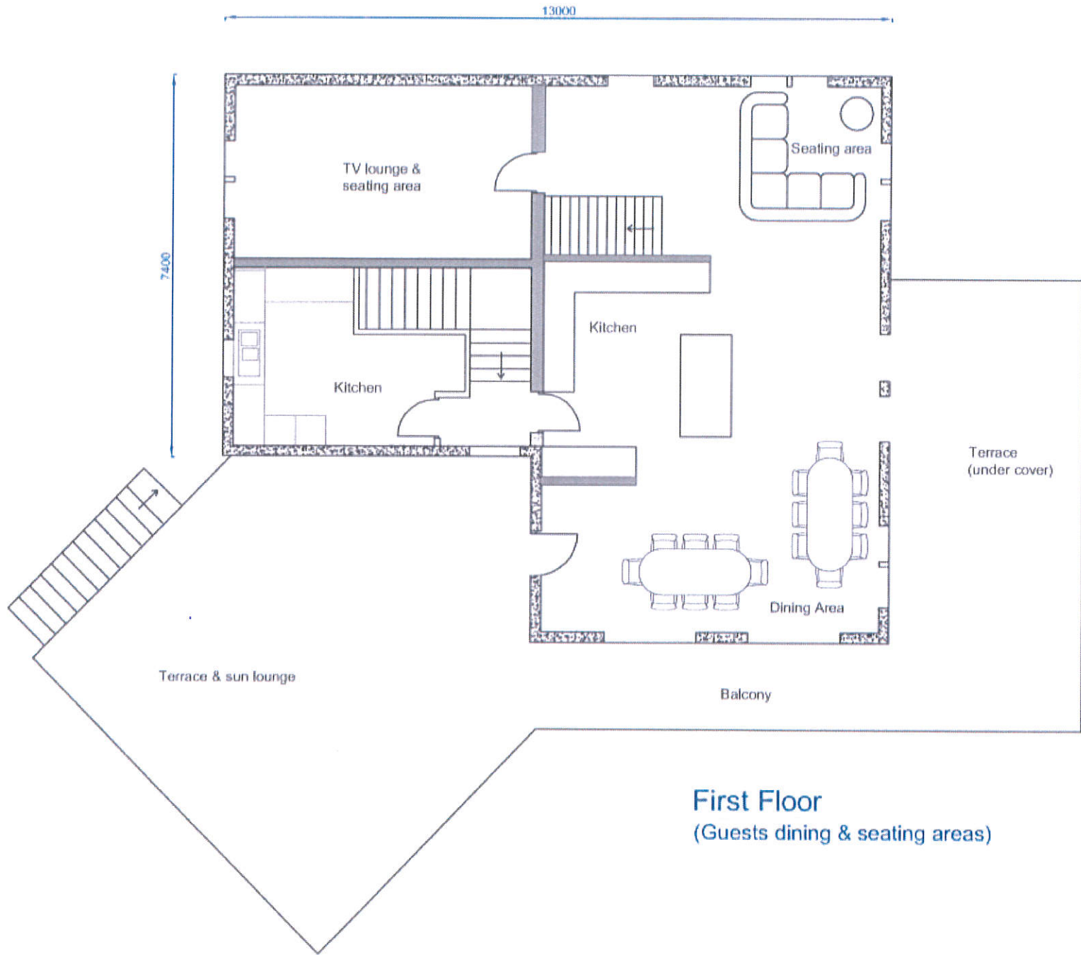
First Floor (Guests dining & seating areas)